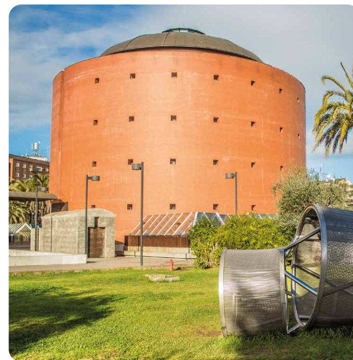
Extremaduran and Latin American Museum of Contemporary Art